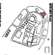
SITE KEY PLAN